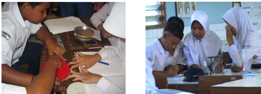
Figure 5. Students engaged in mathematics and science learning