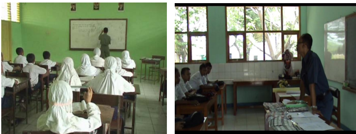
Figure 4. Mathematics and science teaching in conventional ways

teachers contributed to the low quality of mathematics and science teaching. These teachers tend to dominate mathematics and science classes, instead of let students learn. We still find a situation of mathematics and science teaching with teacher centered in Indonesia. Students were copying notes or listening to the mathematics or science teachers. There were no interaction among students and they got boring in mathematics and science classes. Therefore, it is challenge to shift from mathematics and science teaching to mathematics and science learning (Figure 4). Collaborating with teachers has been done regularly for 3 years in promoting mathematics and science learning applying modified Japanese tradition of lesson study under JICA cooperation. We facilitated teachers worked collaboratively to think problems and share views to design a lesson plan that promotes student active learning through hands-on activity, mind-on activity, daily life, and local materials. Then, it was tried out at real class and students activities were observed to collect data for further discussion following class session. It is slow but sure to shift teacher's mind set from teaching to learning. We found improvement of the teachers in facilitating student learning. They let students explore through experiment mathematical and scientific phenomenon (Figure 5). The developed in-service teacher training resulted in improving teaching quality within the district site.