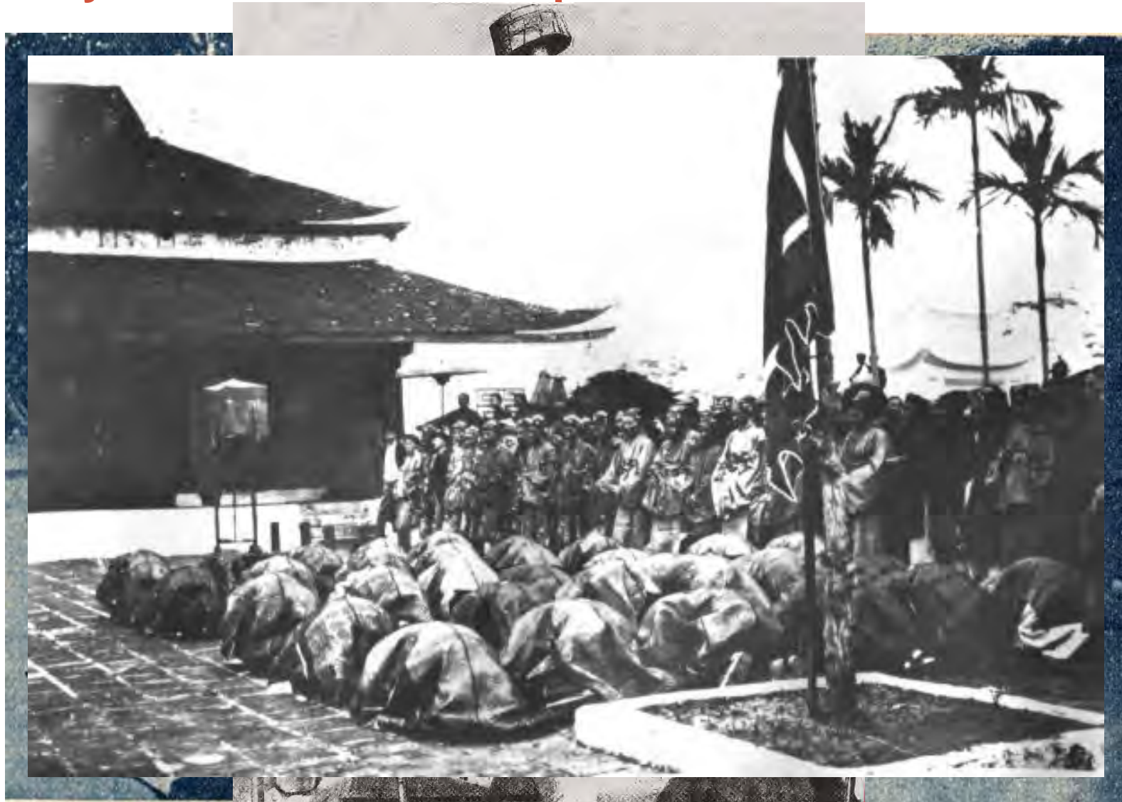
50. Trường thi - Champ de concours (le petit journal 1895)