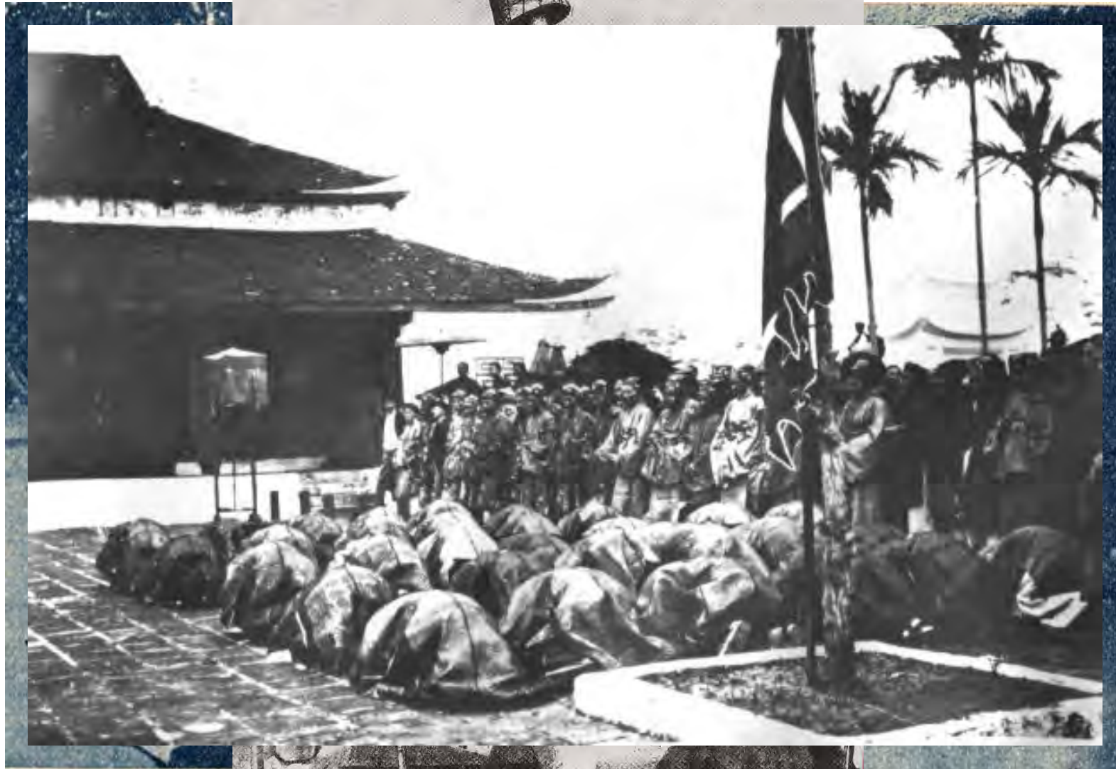
50. Trường thi - Champ de concours (le petit journal 1895)